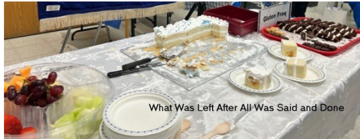
What Was Left After All Was Said and Done

One week after that, on April 30 th , we celebrated the conclusion of the regular part of our 2023 - 24 season with a catered dinner. We're definitely thinking of inviting that caterer back!