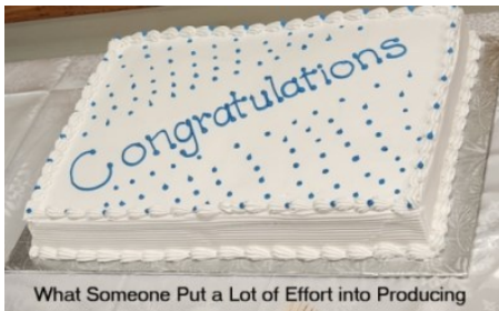
What Someone Put a Lot of Effort into Producing

To conclude proceedings after enjoying the exertion of participating in some sprightly squares, a magnificent celebratory cake was produced along with some other culinary items of interest.