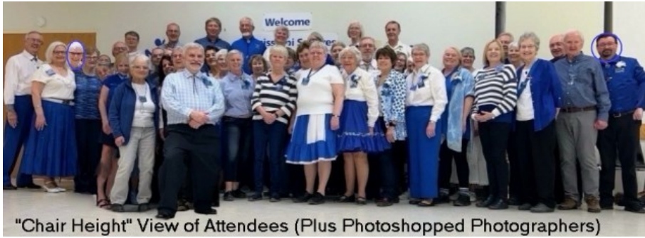
"Chair Height" View of Attendees (Plus Photoshopped Photographers)

Later it was noticed that the above image was missing a few people who were present that night.