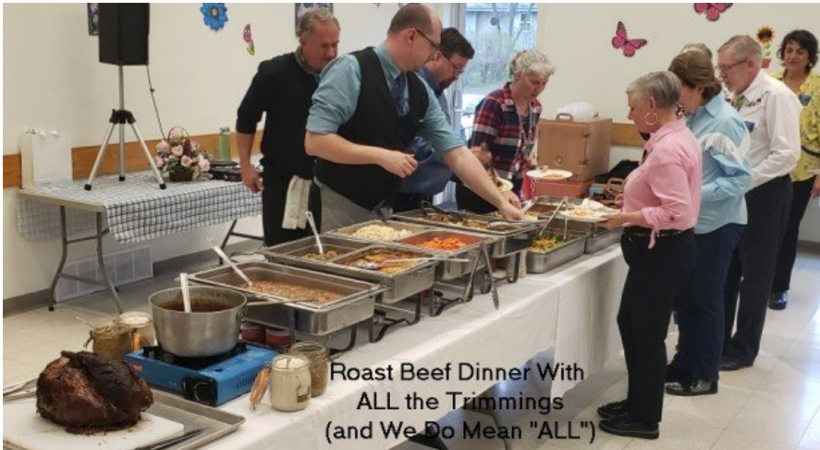
Roast Beef Dinner With ALL the Trimmings (and We Do Mean "ALL")

One week after that, on April 30 th , we celebrated the conclusion of the regular part of our 2023 - 24 season with a catered dinner. We're definitely thinking of inviting that caterer back!