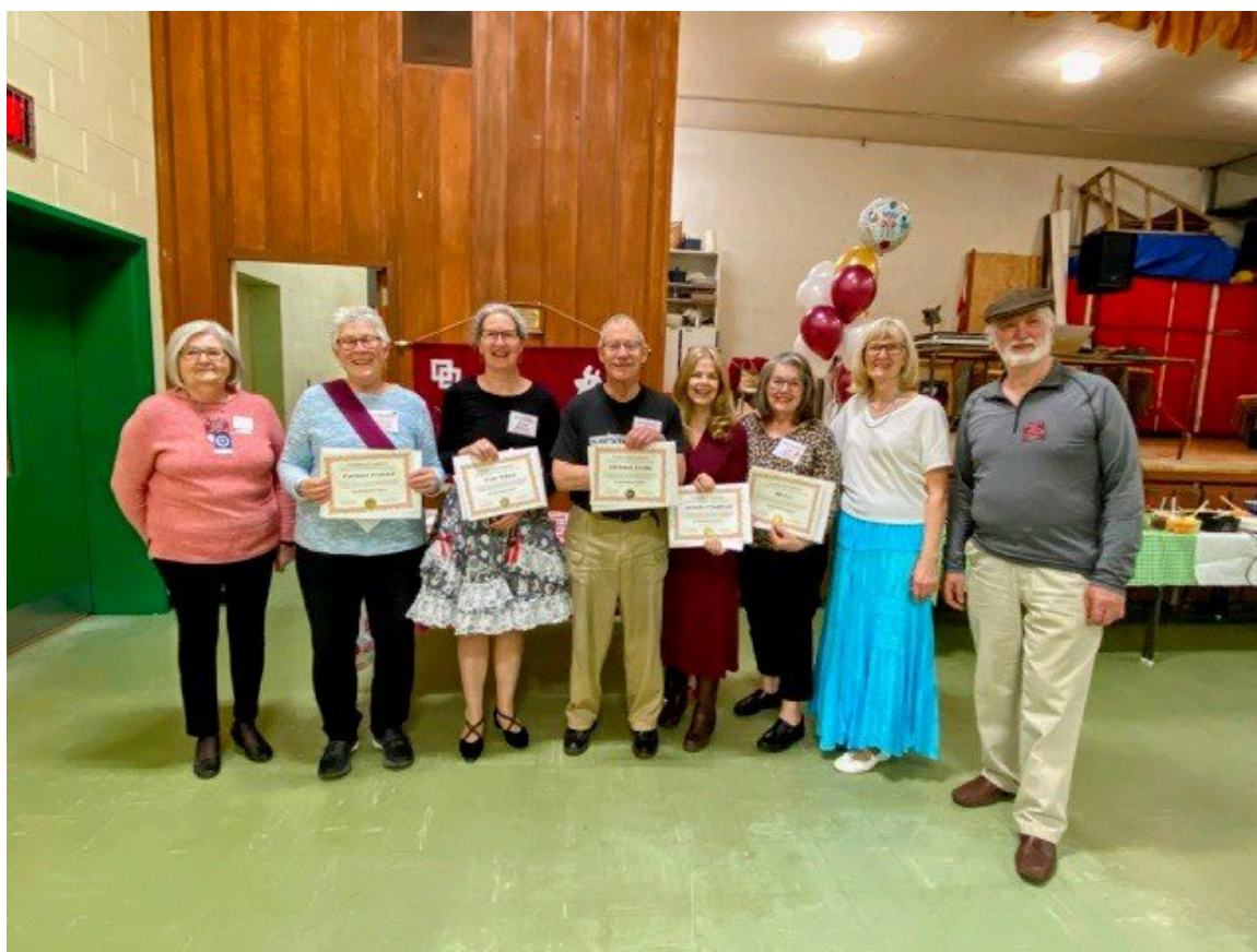
Meri Squares SSD graduation April 2024

This year is the 55th Anniversary of the Meri Squares Club. To celebrate, we invite everyone to join us on November 21, at 7:15 pm, Westminster Church, 470 Roosevelt Ave, Ottawa. There will be Mainstream/Plus dancing and, of course, cake! Come out and join us!