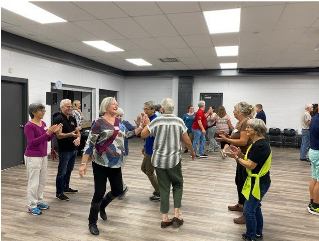
Meri Squares Open House September 2024