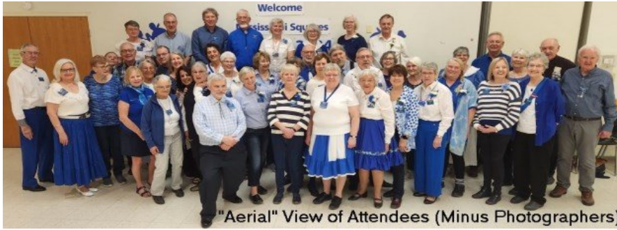
"Aerial" View of Attendees (Minus Photographers)

Later it was noticed that the above image was missing a few people who were present that night.