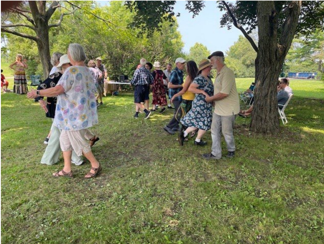
Meri Squares Summer Picnic July 2024